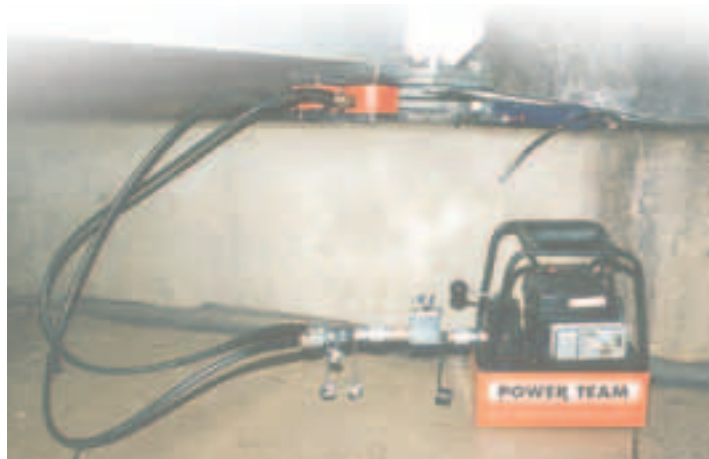
Gasoline Powered Hydraulic Pumps like this PG303 help provide hydraulic force at remote locations.