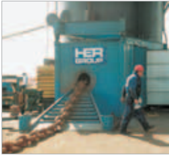
PE4004S pump and RD3006 cylinder used in a special press which repairs damaged chain links for the shipping industry.