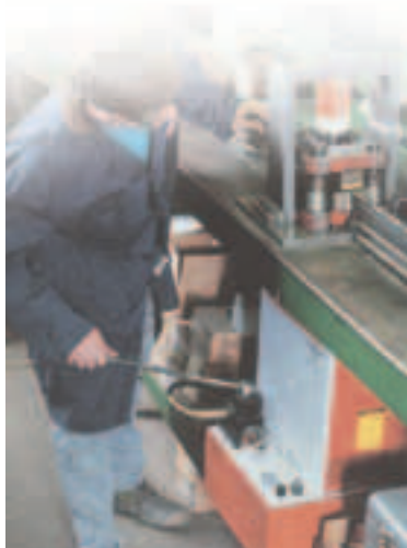
Hydraulic Machine Press Operation.