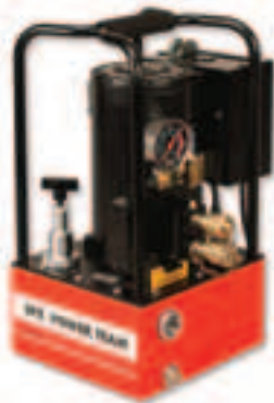
PE30TWP Torque Wrench Applications See page 171