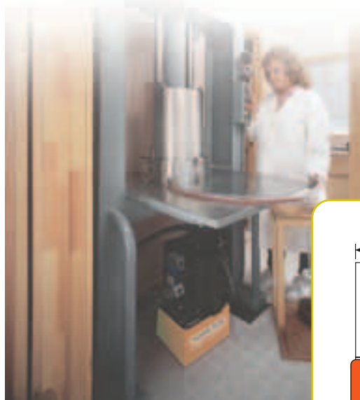
PE21 series pump and RD5513 cylinder used in a special press that produces pharmaceutical-grade extracts for herbal medicines.